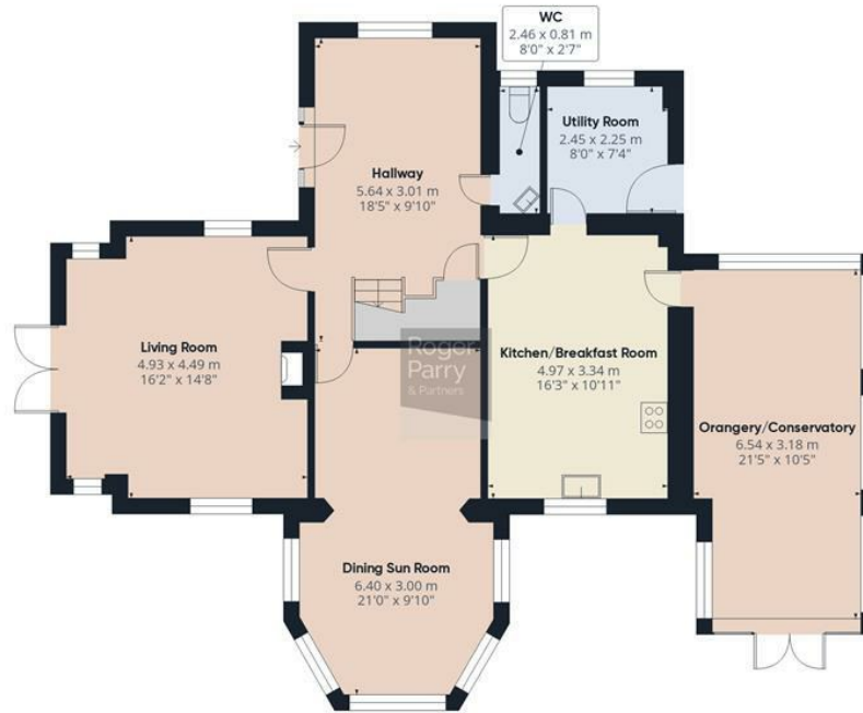
Ground floor Building 1